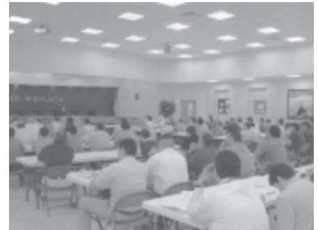
LRGV TPDES Storm Water Task Force Seminar Series Co-Hosted by the LRGVDC. Approximately 100 attendees.

Texas Pollutant Discharge Elimination System (TPDES) Storm Water training was held at the City of Weslaco Legislative Chamber, Friday, May 12, 2006. The training was sponsored by the Lower Rio Grande Valley Development Council, the City of Weslaco, Texas A & M Kingsville and the Storm