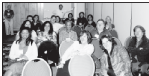
2nd Annual South Texas Caregiver Conference attendees sharing a brief moment of seriousness during the opening session.

The conference was a success with approximately 70 in attendance. This conference has been structured to be a professional development opportunity for professional staff that work directly with family caregivers. A preliminary review of the evaluations shows that the conference attendees were very satisfied with the arrangements and the overall sessions. The dates for the 3rd Annual South Texas Care Conference are November 3 - 5, 2007 at the Holiday Inn Sunspree in South Padre Island. The only casualty of the conference was the tie worn by the Director of the Area Agency on Aging. During the opening session a South Padre Island Police officer cut the tie in half because of the Island's "No Tie" Ordinance.