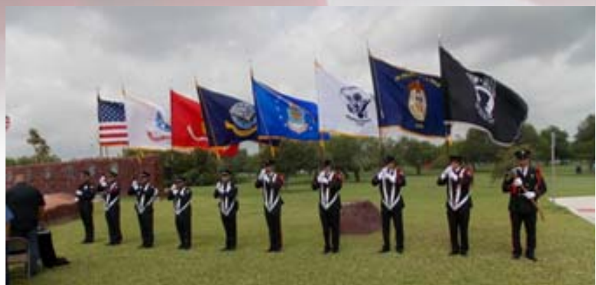
Harlingen Police/Fire Department Color Guard