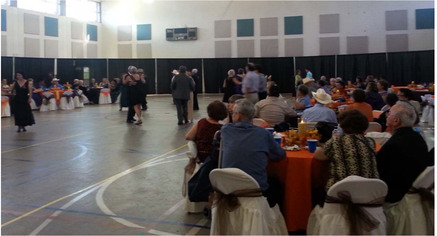
In the spirit of promoting healthy living, 12 couples competed for 1 st place in a dance contest.

LRGVDC's Area Agency on Aging in collaboration with Texas Department of Aging & Disability Services, HEB, Cigna-HealthSprings, Caregiver S O S Wellmed, and the City of McAllen held the "Age Well - Live Well Senior Fall Formal" on Saturday, October 11 th at the Palmview Community Center in McAllen.