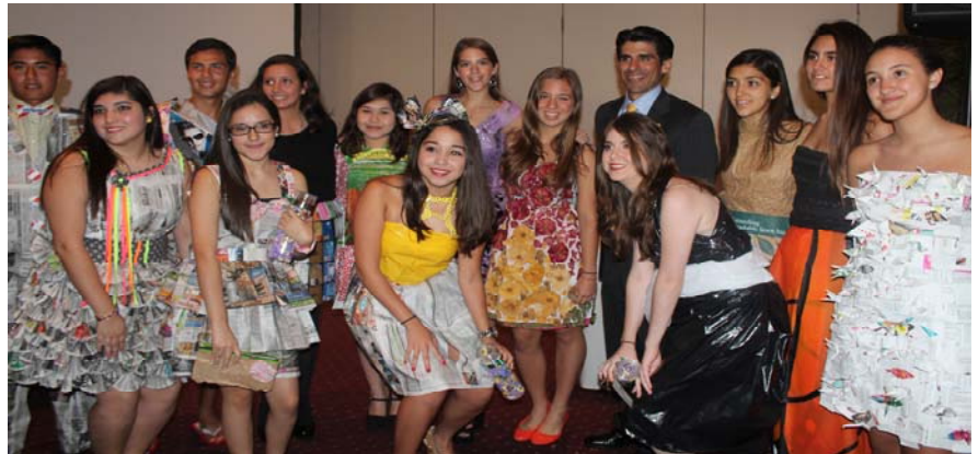
"Trashion Show" participants from the following schools: Veteran's Memorial High School, Rivera Early College High School and Saint Joseph Academy. Trashion materials used: recycled crafts, newspaper, magazines, plastic and paper bags.

The VES Committee strives to engage the participation of the Valley's youth. These efforts included an environmental educational track, and a specifically designed forum for student participation. A fabulous and fun "Trashion Show" was also presented by the Green Teams from Veteran's Memorial High School, Rivera High School and Saint Joseph Academy from Brownsville.