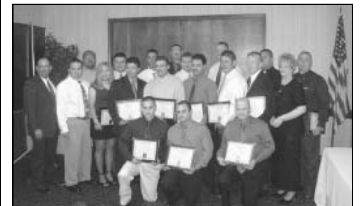
The graduates of the LRGVDC 105th Basic Peace Officer Academy celebrated graduation February 26th at the Palm Aire Banquet room in Weslaco. The graduates represent departments throughout the Lower Rio Grande Valley and include Harlingen, Weslaco, Edinburg, San Benito, Texas State Technical College police departments. Congratulations to all and good luck in your law enforcement careers!